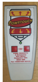
Powrtouch White Handset

E Spec has "www.powrwheel.com" moulded into rear of case