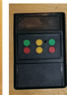
PowrTouch M Spec or Rhyno

Single Axle - Program #7 (7 Flashes) Twin Axle - Program #8 (8 Flashes)